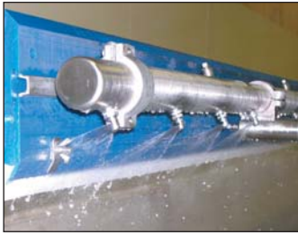
Forming Board Assemblies