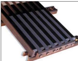
Low Vacuum Boxes