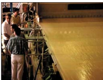
Octopus™ Radial Distributors