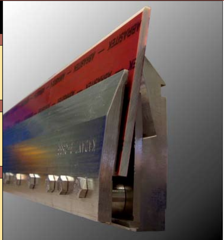
Abrasitek Y Conditioning Blade in a Conformatric Holder