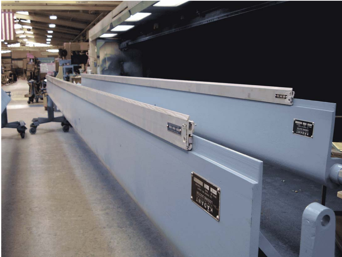
Dryer Doctors with UniSlide Blade Holders