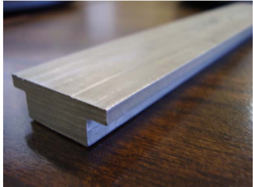
UniSlide T-Rail •Stainless steel •Aluminum